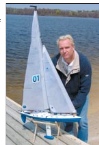
Nirvana from Megatech International, North Bergen NJ.