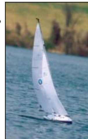
Close hauled on the port tack on the Marsh Creek State Park Lake.

keel unit slides through a slot in the center of the hull, where it is uniquely secured by a 90-degree locking swivel tab that's neatly recessed in the main deck. The folks at Megatech are always thinking, so they even included a varnished, folding wooden stand to rig the racer at the water with the keel attached.