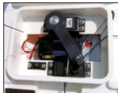
27 MHz FM system nestles in this sealed radio compartment.